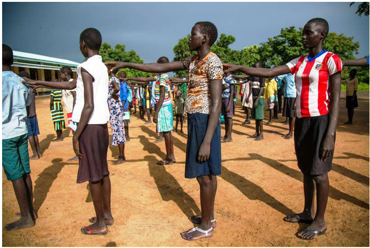
The secondary school gross enrolment rate in South Sudan is the lowest in the world. In 2013, it was just 5%. This figure hides significant gender-based and regional disparities, which mean that in some parts of the country secondary school enrolment rates may be as low as 1% for young women.

Such catastrophically low enrolment rates for entry into secondary education have a profoundly negative effect on future economic and social development. It helps to explain why there are so few skilled or qualified South Sudanese workers in sectors as diverse as the building trades, the hospitality industry or business and accounting. The weak development of South Sudan's human resources is the direct consequence of a long history of marginalisation and exclusion from education and training. Nor will these shortcomings be addressed by continuing to focus to an inordinate degree on the primary schools sector. While it is important to recognise the obstacles to human and economic development posed by continuing conflict and insecurity, it is equally essential to address the specific constraints to sustainable development presented by a perpetuation of policies and priorities that have restricted access to secondary schooling and reinforced damaging educational inequalities.