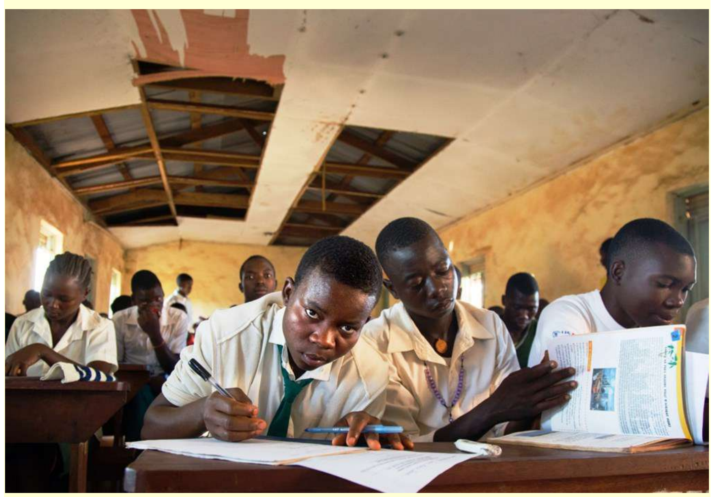
Students in Yambio taking a biology test. Most secondary schools have too few classrooms; are in a poor state of repair and are cramped and over-crowded. Given trends in primary school enrolment and a growing population, the school estate is desperately in need of both improvement and expansion.

The most telling indicator of the capacity of the secondary school estate to meet the demands placed on schools is the number of classrooms in which to conduct lessons. The classroom is the space in which teaching and learning happens and if that space is too small and over-crowded, lacking essential furniture or not conducive to effective teaching, initiatives that focus on increasing access to secondary school, without considering the capacity of the secondary sector estate, will only exacerbate existing problems.