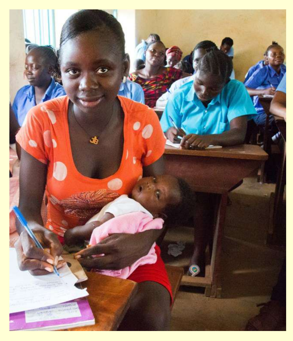
Teenage pregnancy is one cause of female student dropout from secondary school – but there is no reason why it should prevent them from completing their secondary education later. In Yambio, Yabongo Secondary School offers evening classes where young women and men can bring their children to class.

Inevitably, of course, some girls will become pregnant and some boys will become fathers. At the moment it is not easy for pregnant girls or young mothers to continue attending secondary school. But in an unusual and encouraging initiative, Yabongo Secondary School has set up a programme to provide evening classes for those — male or female — who have dropped out of school, but want to complete their secondary schooling. Students with young children bring their babies to class where they can sleep or be looked after.