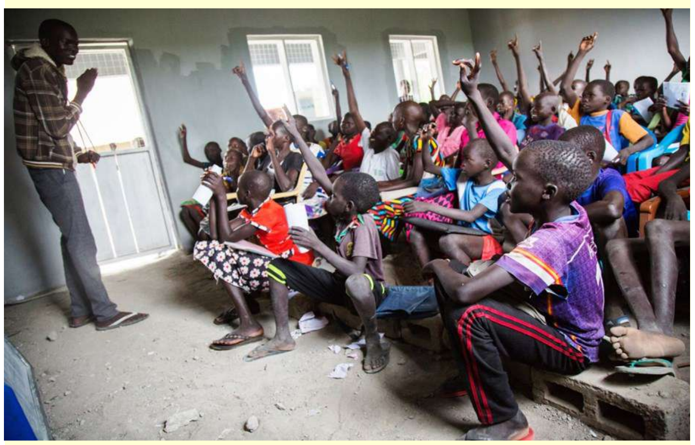
Even though most teachers in South Sudan work in classrooms that lack desks, chairs or teaching materials, an engaging and stimulating teacher can capture the interest and attention of children.

Both the Government of South Sudan and its major education donors have ambitious targets to expand access to, and to improve the quality of, secondary education in the country. WTI applauds their commitment – but if the pursuit of the Millennium Development Goals has taught us anything, it is surely that increasing access to schooling is only part of the solution. To achieve enduring change, change that will transform personal development as well as educational outcomes, it will be necessary to improve the quality of teaching. That means investing in teachers as matter of priority, not as an after-thought.