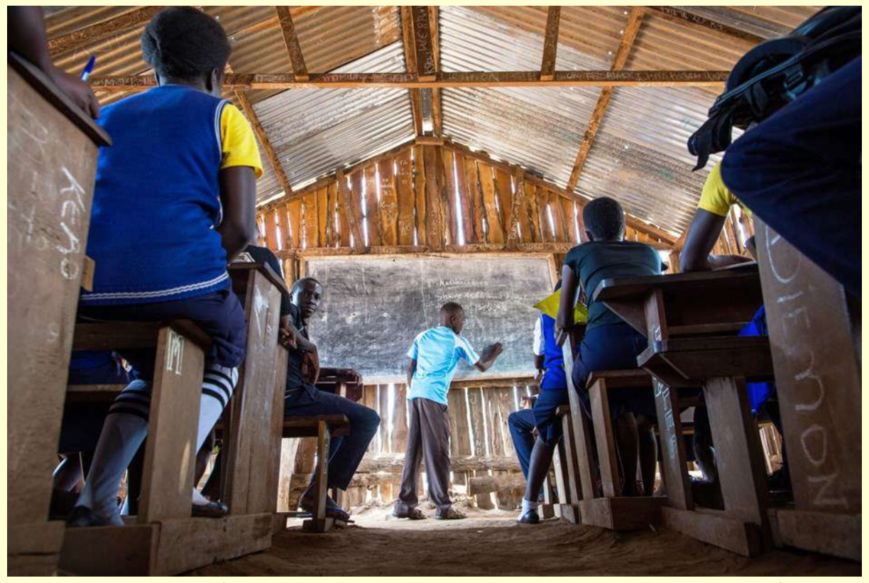
A Mathematics class at King's College Secondary School in Yambio, Gbudwe State. Structures made from locally available raw materials may be a relatively cost-effective response to the urgent need for more classrooms.

In practice, the majority of secondary teachers have been in post for years. They may have been appointed when South Sudan was part of Sudan and a large proportion of those with an academic or professional qualification may have been trained either in Sudan or, for those who fled into exile, in Kenya or Uganda. Irrespective of the fact that their training may have been in Arabic, rather than English, and the curriculum in which they were trained was not the one currently used in South Sudan, it is essential to recognise that it is these people who are currently keeping the secondary sector going. It would cause a major disruption to the functioning of the sector if a significant proportion of existing teachers were taken out of the system either permanently (through compulsory retirement, for example) or even temporarily (to attend a centre-based course for 2 or 3 years).