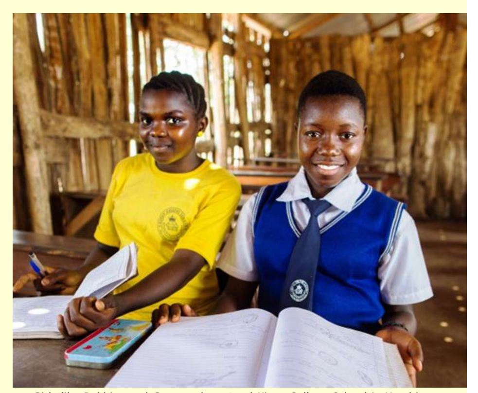
Girls like Bakhita and Grace, who attend Kings College School in Yambio are exceptional - simply because they will complete secondary school. The number of young women who drop out of secondary school each year is twice as high as the number of young men.

All recent EMIS reports make one point startlingly clear that very few girls make the transition to secondary school and even fewer complete their secondary education. In the whole of South Sudan in 2017, less than 30,000 females were enrolled in secondary school. Even that number gives a misleading impression of the rate of participation. There are just over 12,000 young women enrolled in S1, but the number the number of girls who will complete four years secondary school education is less than 3,500.